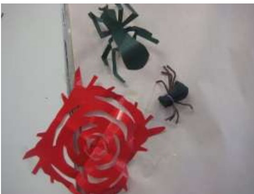
HERE THE FLAT SPIDERS ARE FOLDED TO MAKE A 3D FIGURE