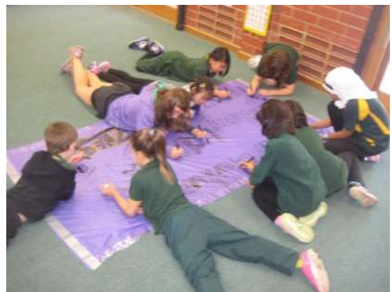
WELCOME IN MANY LANGUAGES