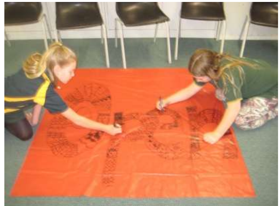
OPEN DAY SIGN